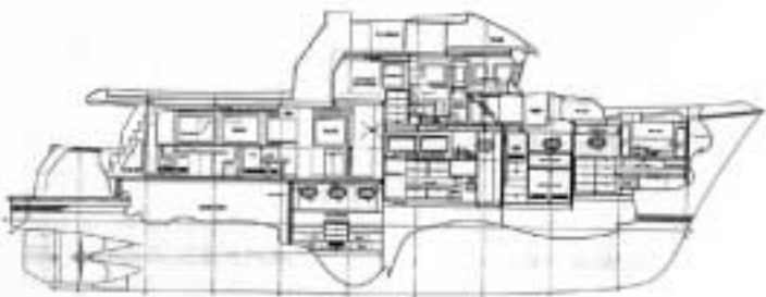
Port Interior Section