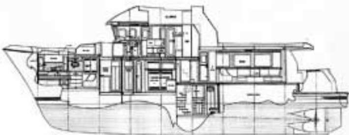
Starboard Interior Section