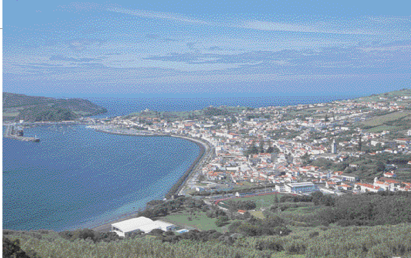
Horta (above), the main town in the rugged and isolated Azores (right), was a welcome sight for rally crews — particularly the one aboard Uno Mas , whose scare during the 1800-mile voyage from Bermuda was the most perilous event during the entire passage.