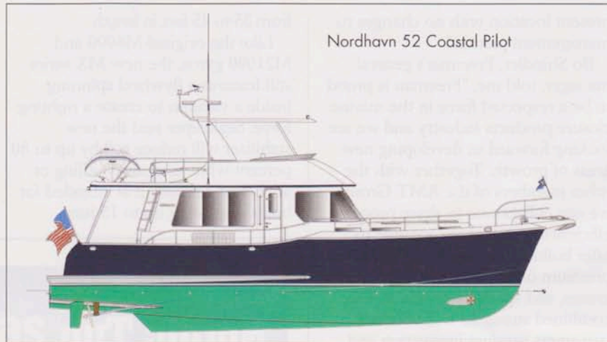
Nordhavn 52 Coastal Pilot

Pacific Asian Enterprises, Inc. (P.A.E.), leaders in the boatbuilding industry, are adding a 52-foot Coastal Pilot to the successful series. The coastal cruiser will have a sleek sedan